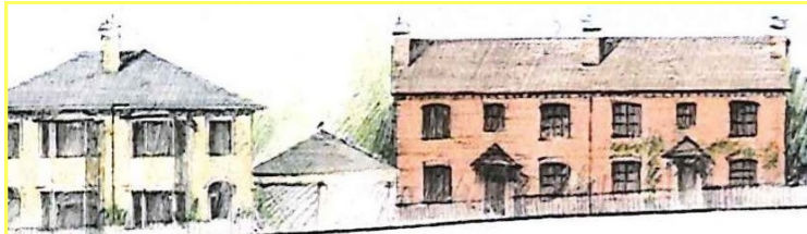
Artist's impressions giving a feel of the proposed design of some of the homes in Tent 1 were included in the exhibition material.

If you weren't able to make it to the exhibition, the material is still on display in the Town Hall on the board adjacent to the Town Clerk's office. It is anticipated that the full planning application will be submitted in March, and will be open to public consultation; check www.ashford.gov.uk/planning-and-building-control to see the plans and submit comments. The plans will also be on show at the Tenterden Gateway (2 Manor Row, High Street), and comments may also be submitted by post to the Planning Department, Ashford Borough Council, Civic Centre, Tannery Lane, Ashford, Kent, TN23 1PL.