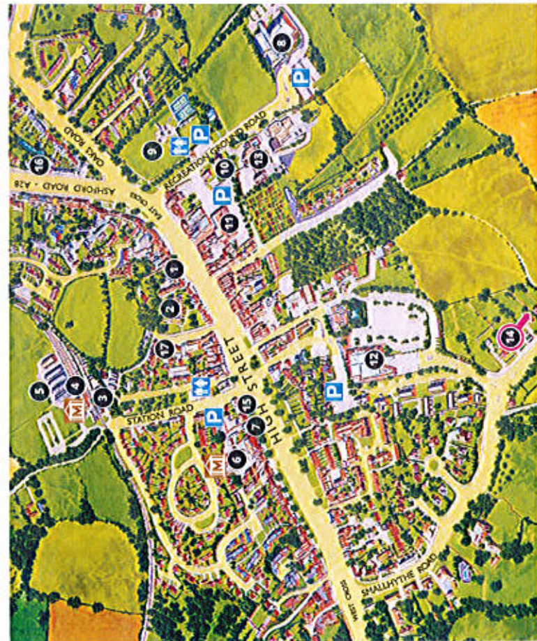
Original map designed by the artist of Kent Production Society